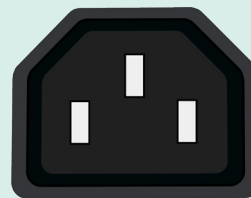
C14 AC Inlet Connector (Power Supply)