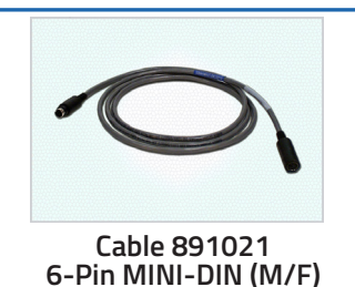
Custom Length cables available for your switch installation. State cable length (###) when ordering. Part No Description 880841- Custom Length Custom Length in Feet, VGA Monitor Cable, HD15 (M/M) 891022- Custom Length Custom Length in Feet, VGA Extension Cable HD15 (M/F) 880835- Custom Length Custom Length in Feet, PS/2 Keyboard/Mouse/Extension Cable, Mini DIN-6 (M/M) 891021- Custom Length Custom Length in Feet, PS/2 Keyboard/Mouse/Extension Cable, Mini DIN-6 (M/F)